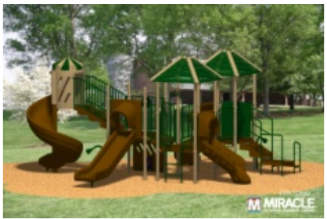
Diagram of the primary elementary play system that is the Parent Organization's goal for the Fall Festival fundraiser

This year's Fall Festival will be held on Friday, October 9 from 6:00 - 8:30 p.m. Come make new friends and enjoy food, square dancing with a live band, and activities for the kids while giving service to the school and raising money for the new elementary playground system.