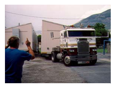
Portable trailers added to the old Pleasant Grove AHS building

In 2000, portable trailers were needed to accommodate the School's growing student enrollment of The Board of 275. Directors approved the relocation of American Heritage School to a new campus, which would