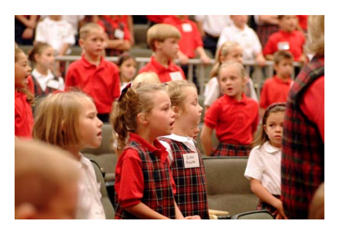
AHS Teachers Awarded "Master Teacher" Honors

AHS school averages last year) for both elementary and middle school. In addition, Grades 9 and 10 took the ACT "PLAN" and ACT "Explore" exams and averaged well above state and national averages, including five students who received special letters of recognition from the Utah State Office of Education for exceptional performance on these exams relative to high school peers statewide (national percentiles are not provided by ACT for the PLAN and Explore exams and we will not have year-over-year trend data until next year; this was the first year taking this these exams). Congratulations AHS students, teachers, and families! Keep up the great work.