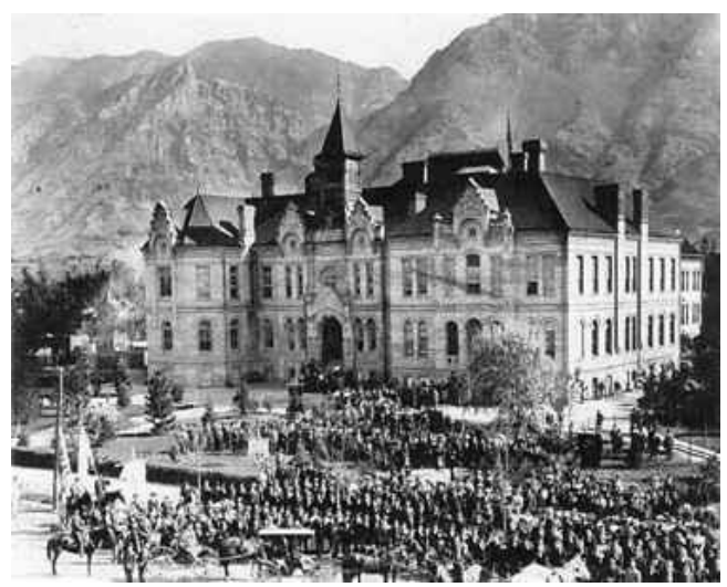
Brigham Young Academy, Founders Day, 1900

<u>In 1896</u>, as a result of financial strain, the Board of Trustees of Brigham Young Academy voted to transfer the academy to the Church.